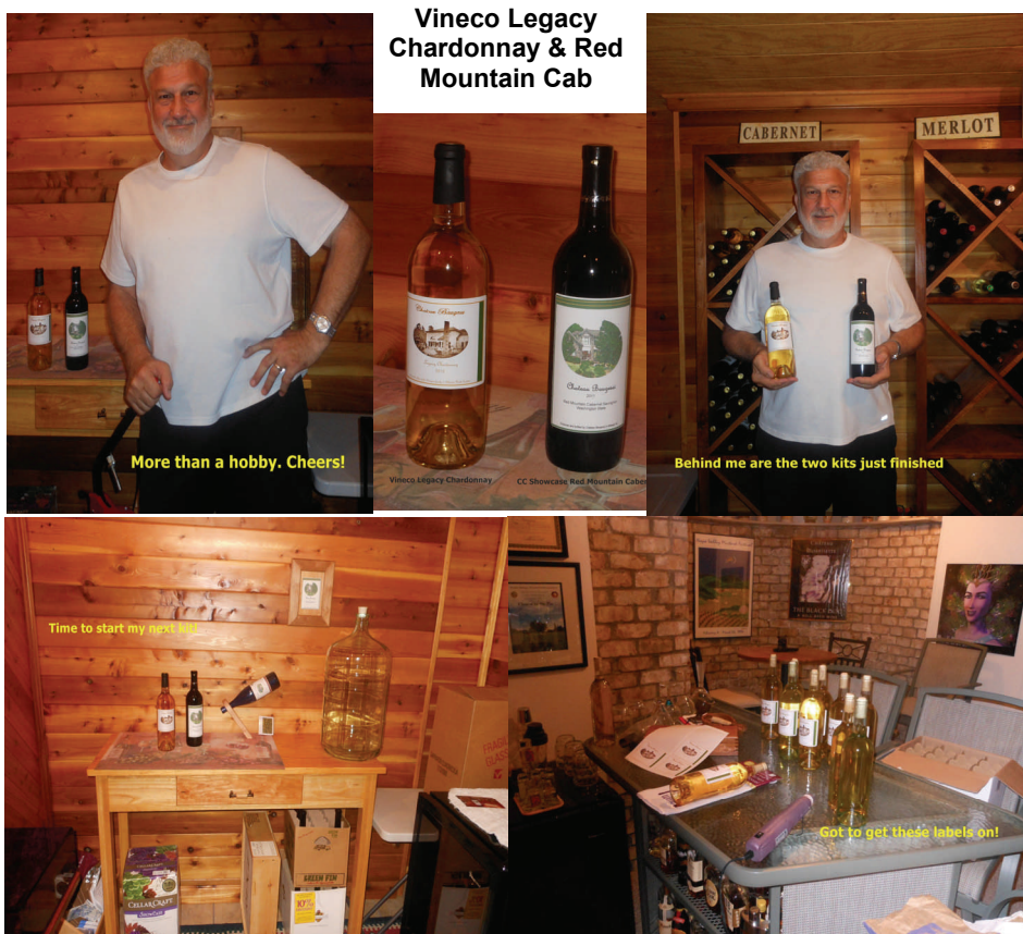
Vineco Legacy Chardonnay & Red Mountain Cab