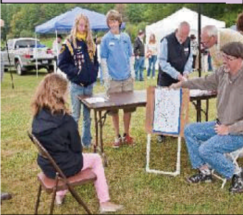
Caricature artist was a big hit at the 13th. Annual Thistle Meadow Wine festival on October 3.

We anticipate that these products will be available to ship the 2 nd or 3 rd week of each month of release, respectively.