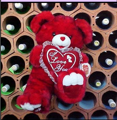
Tom says, "Happy Valentine's Day!"

Supplies of the wine chilling bags are limited. Details regarding the specific dates and any other information concerning this promotion will be posted on our web site as they become available. Until then, please be patient and await the start of the promotion!